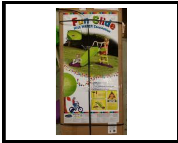
EXHIBIT # 5