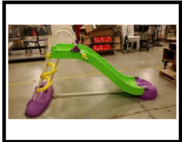
SAMPLE PRODUCT – SIDE VIEW