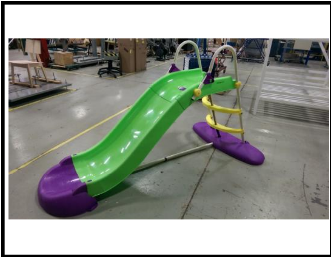
SAMPLE PRODUCT - ASSEMBLED