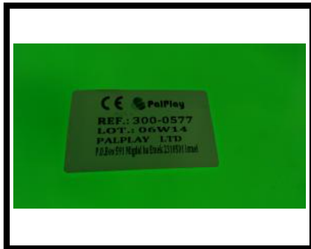
EXHIBIT # 6